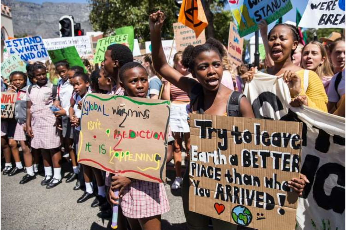
Young people in South Africa taking part in a climate protest outside of the Parliament, 2019. (https://www.groundup.org.za/article/climate-strike/).